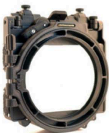
Clip-one 3F-138 shown with the adaptor ring R136-114, in a captive position.