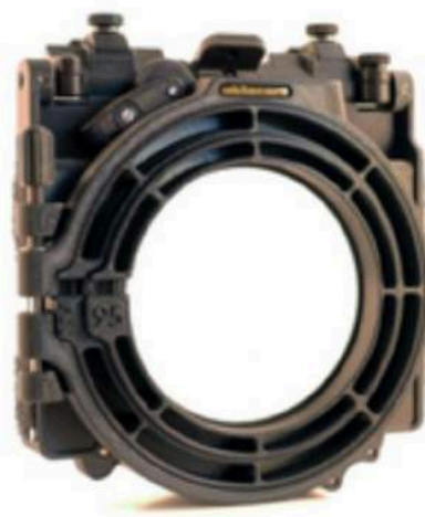
Clip-one 3F-138 shown with the adaptor rings R136-114 + R114-95, both in a captive position.